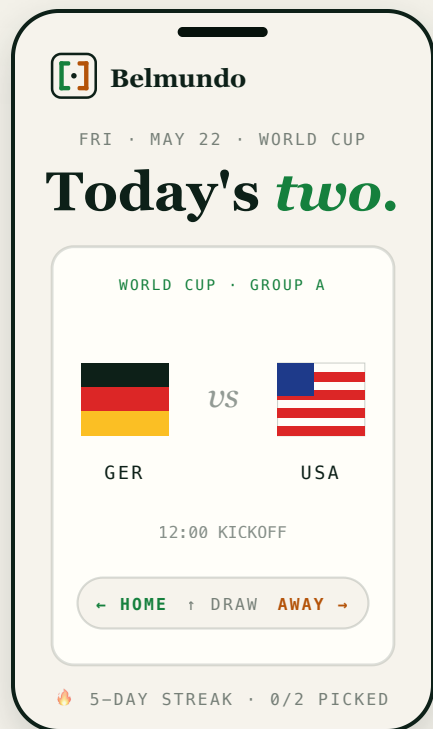
01 Pre-match Pick your winner. Two matches. A few quick picks.